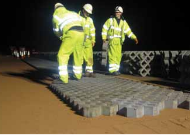
TRUCKPAVE 80 weighs only 9kg and is easy to handle and install